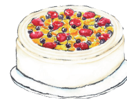
Fresh fruits cake