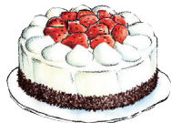
Strawberry chocolate cake 9.5in $190.00

Please make a reservation at least 2 days in advance and pay at the time of reservation.