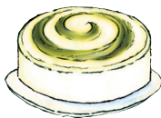
Green tea mousse 9.5in $180.00 7in $126.00