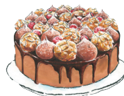
King chocolate cake 9.5in $200.00