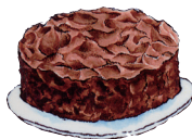
Chocolate custard cake 9.5in $190.00