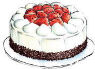
Strawberry chocolate cake 9.5in $190.00

Please make a reservation at least 2 days in advance and pay at the time of reservation.