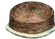
Chocolate cake 9.5in $130.00 7in $90.00