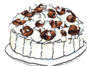
Black&White chocolate cake