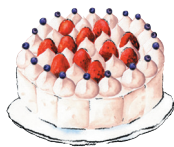
Queen of cake 9.5in $200.00 7in $140.00

Please make a reservation at least 2 days in advance and pay at the time of reservation.