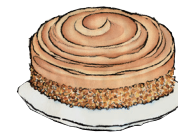
Royal milk tea cake 9.5in $150.00