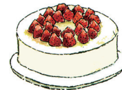
Strawberry cake 9.5in $180.00 7in $126.00